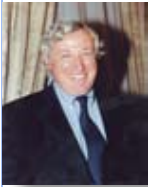
Ambassadeur Pierre Vimont Ambassadeur de France aux Etats-Unis