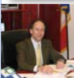
Jean-Baptiste Main de Boissière Consul Général de France à Chicago