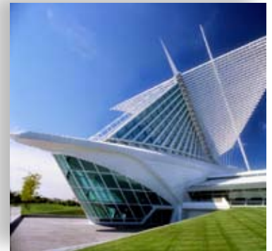
Milwaukee Art Museum

Chapter presidents, members, executive directors, teachers and anyone interested in French and meeting Francophiles from around the country are all welcome and encouraged to attend. The Milwaukee Athletic Club has lovely meeting rooms, where hotel rooms at reasonable prices are available for those attending the convention. (Please reserve a room by early October)